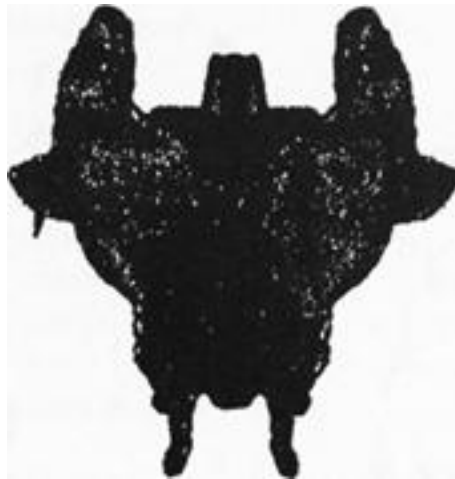
Figure 5.2. An inkblot or... ?

Personal interests, occupations, and personality can strongly influence people's experience. This fact is used in tests like the Rorschach inkblot test that use interpretations of ambiguous figures for personality assessment. In a classic study of imagination, Bartlett noted that subjects asked to interpret inkblots frequently reveal much information about their personal interests and occupation. For example, the same inkblot reminded a woman of a "bonnet with feathers," a minister of "Nebuchadnezzar's fiery furnace," and a physiologist of "an exposure of the basal lumbar region of the digestive system." 2 See Figure 5.2: what does the inkblot look like to you?