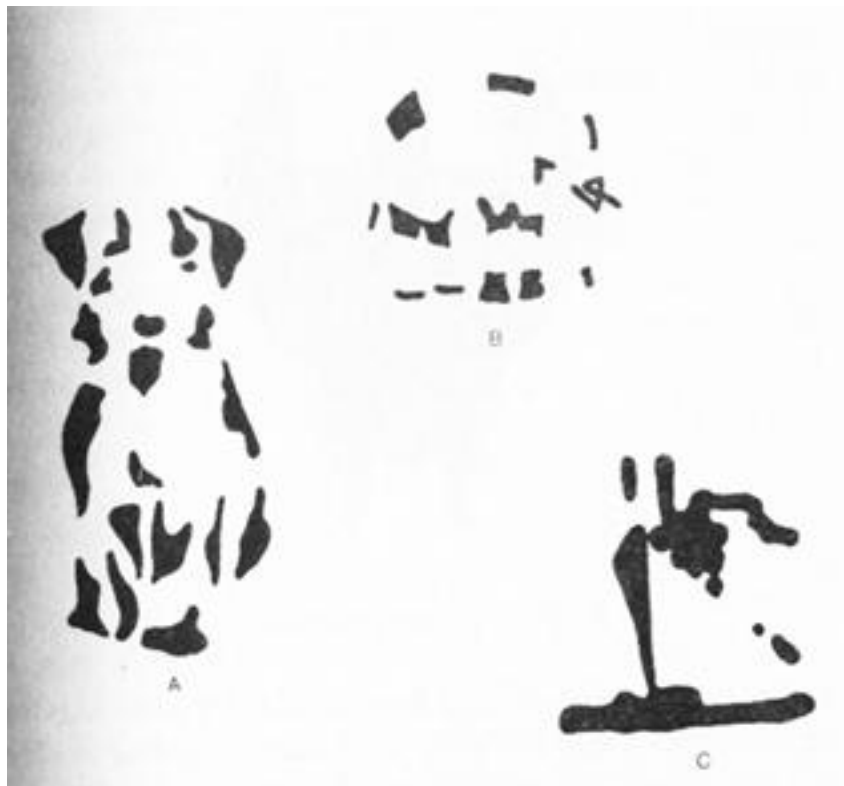
Figure 5. 1. Incomplete figures

It also is easier to perceive the familiar than the unfamiliar. Study Figure 5.1 until you have identified all three elements. How long did it take you to identify each of the three figures? You probably identified the dog first, then the ship, and finally the elephant. This corresponds to the relative familiarity of the three images. The familiar, of course, is the expected.